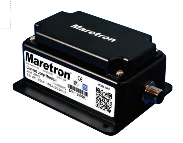
The following accessories are available for the CLM100: