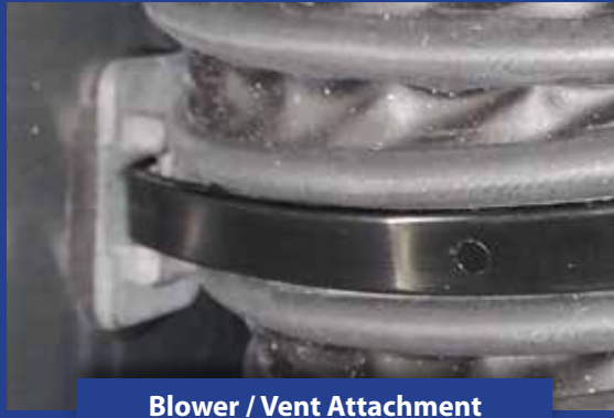
Blower / Vent Attachment