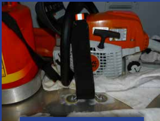
Emergency Vehicle Mounts