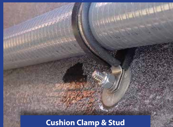
Cushion Clamp & Stud