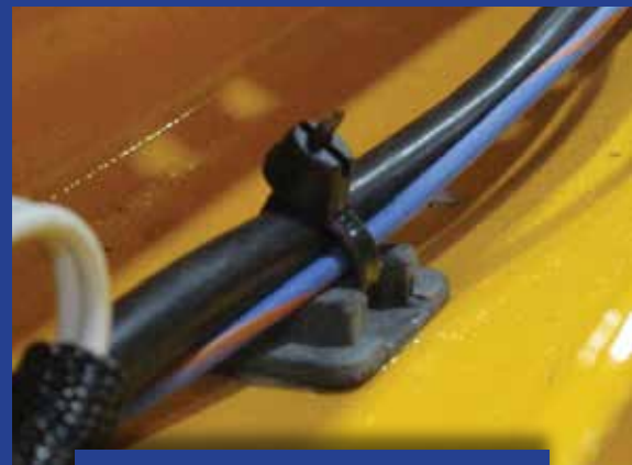
Mounting to Powder Coat