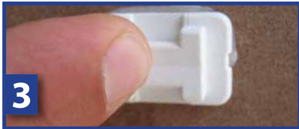
3 Firmly push the part onto the substrate until the adhesive squeezes out from under the base.