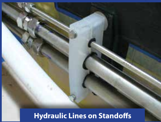
Hydraulic Lines on Standoffs