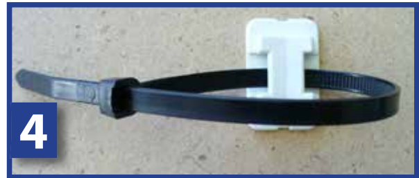
4 Depending on the adhesive selected the fastener is ready for use in 15 - 45 minutes.