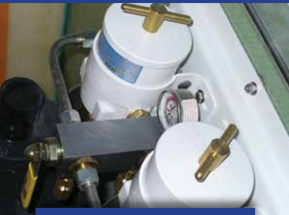
Pumps / Panels Mounting