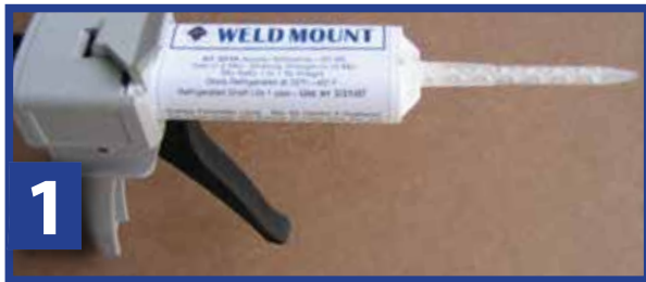
1 Mount the 2 part adhesive cartridge into the dispenser and mount the replaceable mixing tip.

Our system can be easily installed without extensive training eliminating the high costs associated with welding or drilling and tapping.