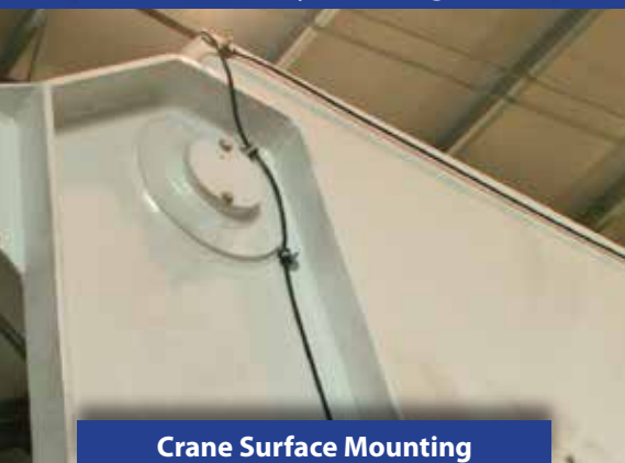
Crane Surface Mounting