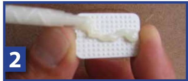
2 Squeeze the handle to dispense a small amount of adhesive onto the bottom of the part.